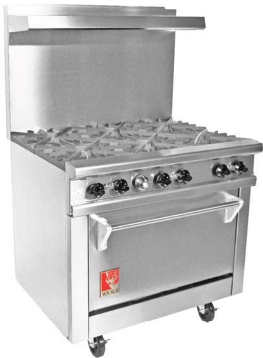
Model W36-W1 shown with optional casters