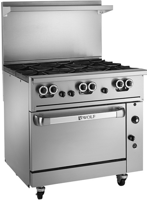
Model C36SFF-6BN (shown with optional adjustable casters)