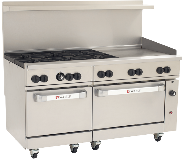
Model C60SS-6B-24G-N (shown with optional casters)