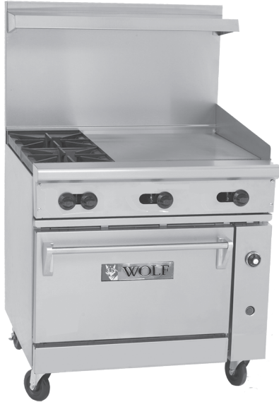
Model C36-S-2B-24G-N (Shown with optional casters)