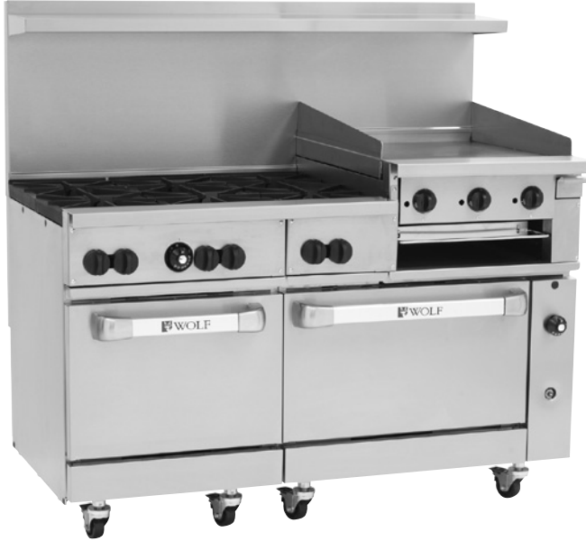
Model C60SS-6B-24GB-N (shown with optional casters)