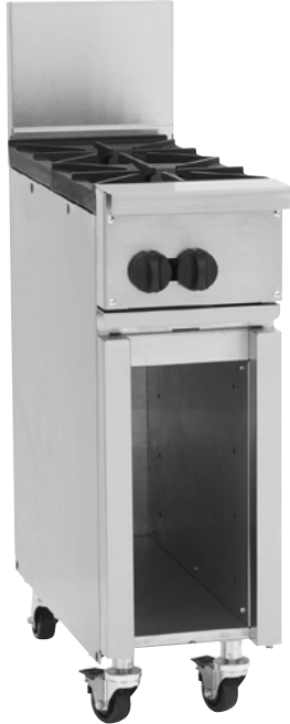
Model C12-2BN (shown with optional casters)