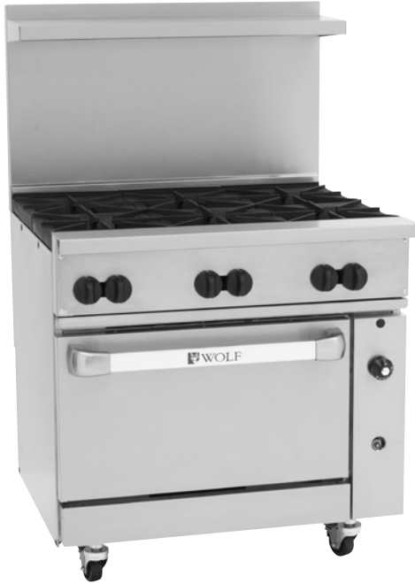
Model C36S-6BN (shown with optional casters)